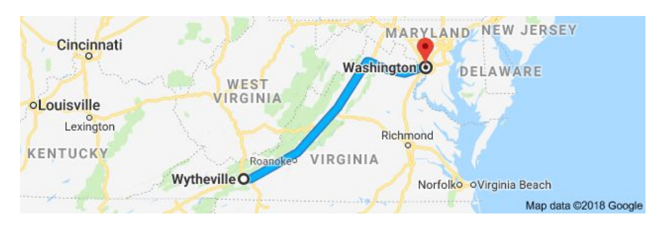
305.6 miles from Wytheville, Virginia to Washington, D.C.